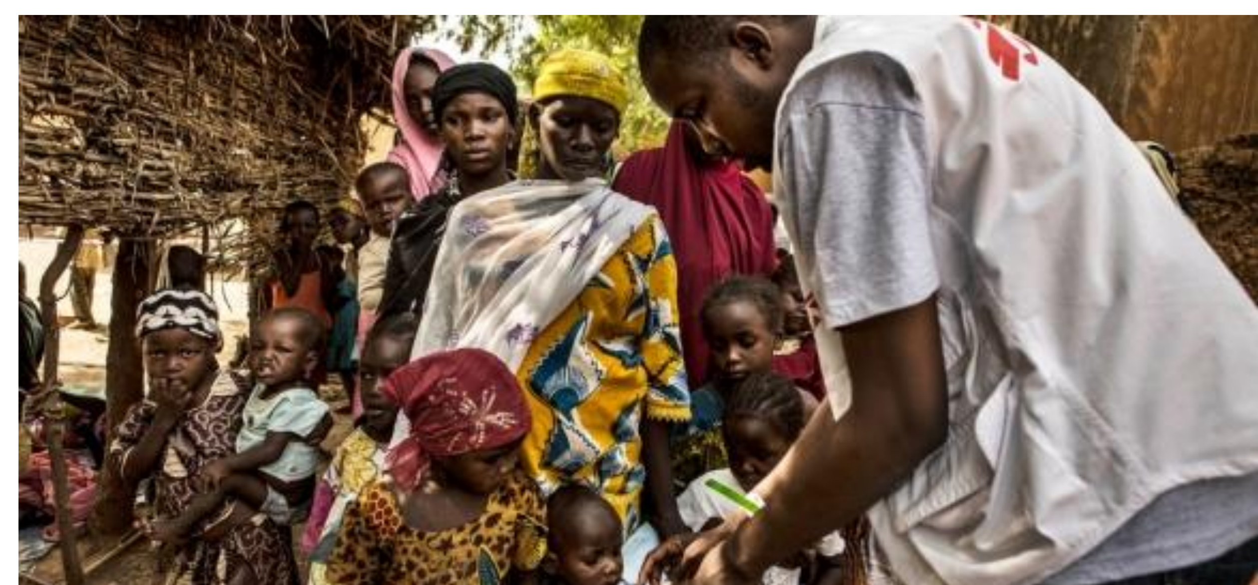
A child receiving SMC, photo credit Juan Carlos Tomasi/MSF

§ Adjusted Wald p<0.001 between both groups of children and adults during each survey