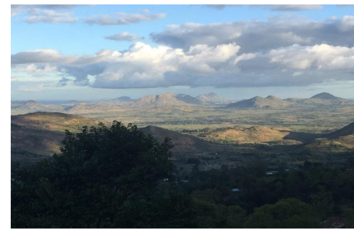
Photos: The study setting and HIV clinic in Chiradzulu